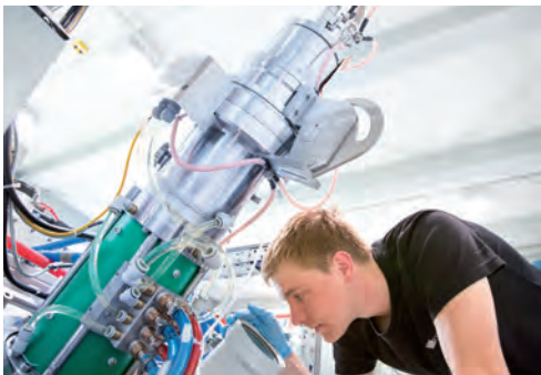
Electron beam source »Easy Beam« developed by Fraunhofer FEP

Combined processes of plasma-activated high-rate evaporation, magnetron sputtering and PECVD